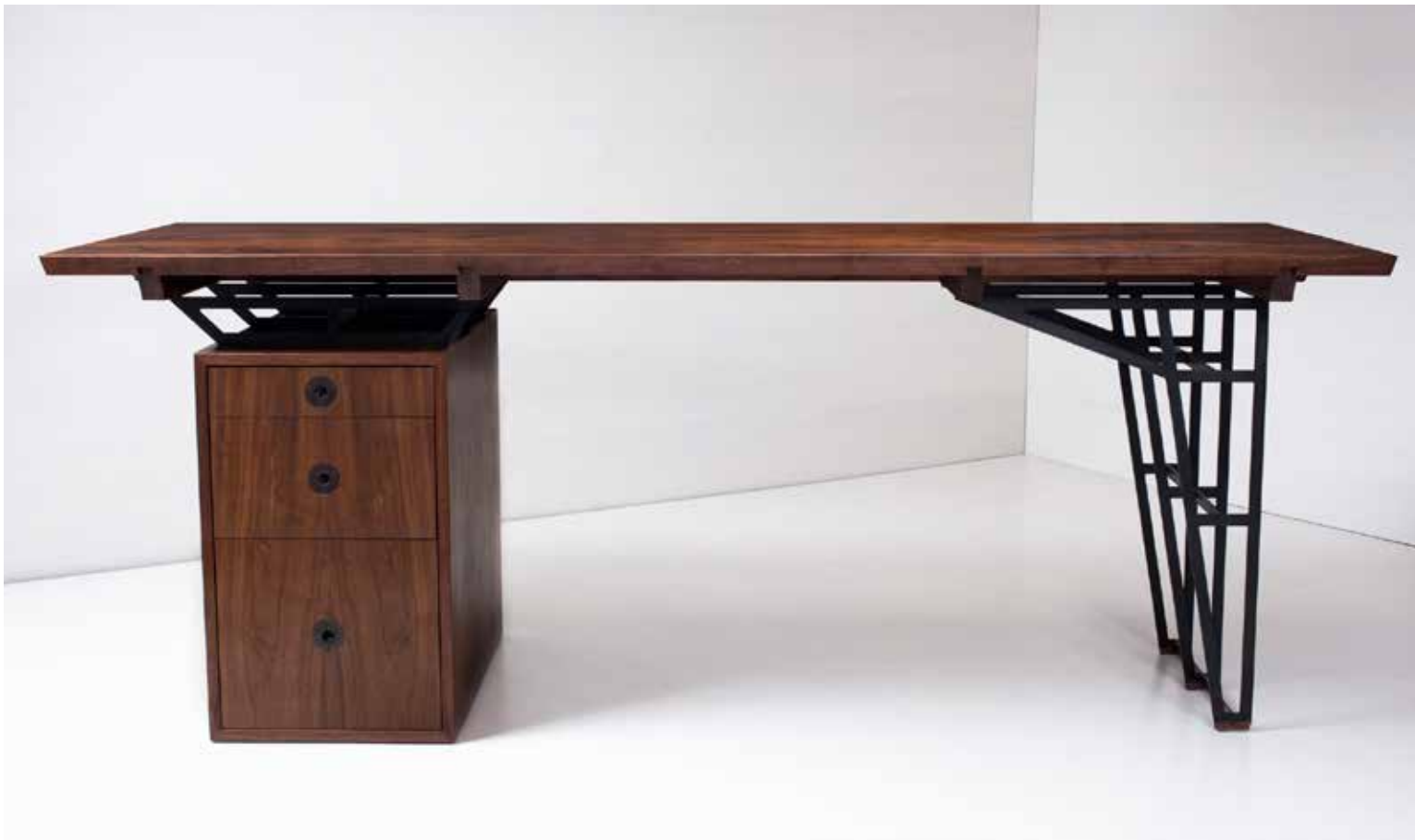
Influenced by the way bridges leave the land and touch down in water, the Bartizan Desk provides an inspirational setting for daily work.